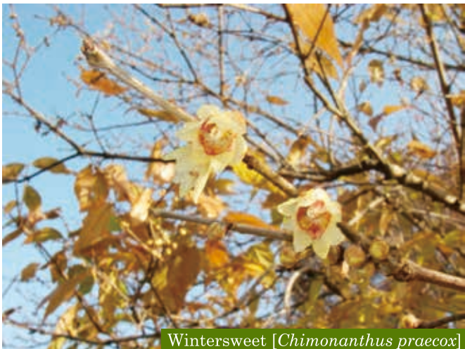
Wintersweet [ Chimonanthus praecox ]