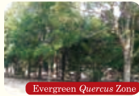
Evergreen Quercus Zone

Trees in this zone include Tsukubanegashi ( Quercus sessilifolia ), Ichigashi ( Quercus gilva ), and Kurogane mochi ( Ilex rotunda ).