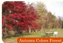
Autumn Colors Forest

In this zone beautifully-colored deciduous broad-leaved trees are cultivated.