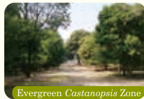
Evergreen Castanopsis Zone

Trees in this zone include Sudajii ( Castanopsis sieboldii ), camellia trees ( Camellia japonica ), and Kakuremino ( Dendropanax trifidus ).