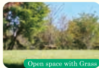
Open space with Grass

The mat-forming lawn spreads on the south-facing slope.