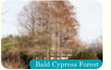
Bald Cypress Forest

The Bald Cypress is a deciduous needle-leaved tree native to North America which grows tall even in marshlands. The Bald Cypress has interesting respiratory roots that protrude from the ground, called knee roots.