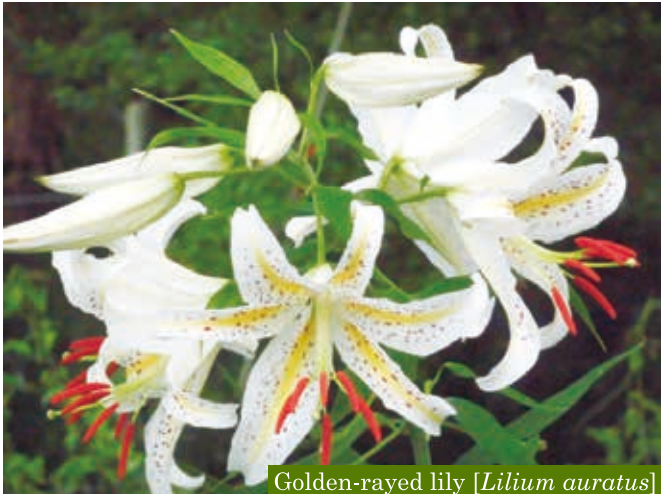
Golden-rayed lily [ Lilium auratus ]