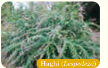
Haghi ( Lespedeza )

Different types of Haghi ( Lespedeza ) are cultivated here. Autumn is the best season to visit the garden.