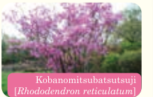
Kobanomitsubatsutsuji ( Rhododendron reticulatum )

Wild azalea trees such as Mitsubatsutsuji ( Rhododendron dilatatum ) and cultivars such as Kurumetsutsuji ( Rhododendron obtusum ) are cultivated.